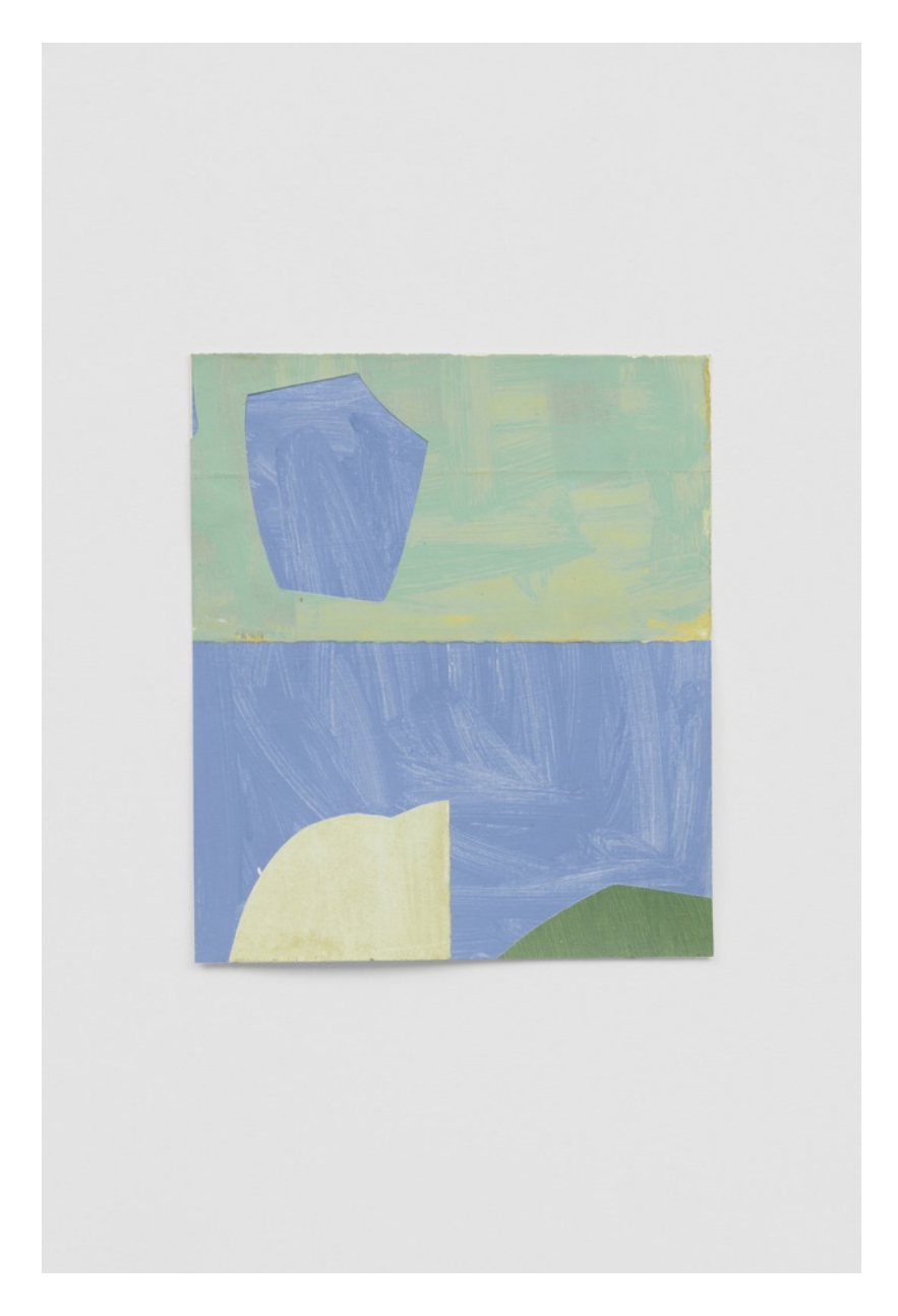
Woodcut, gouache and oil on collaged paper 36 x 26 cm (GOODY_93)