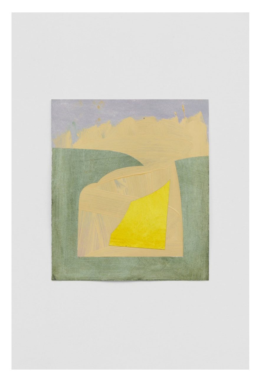
Woodcut, gouache and oil on collaged paper 36 \times 26 \text{ cm} (GOODY_94)