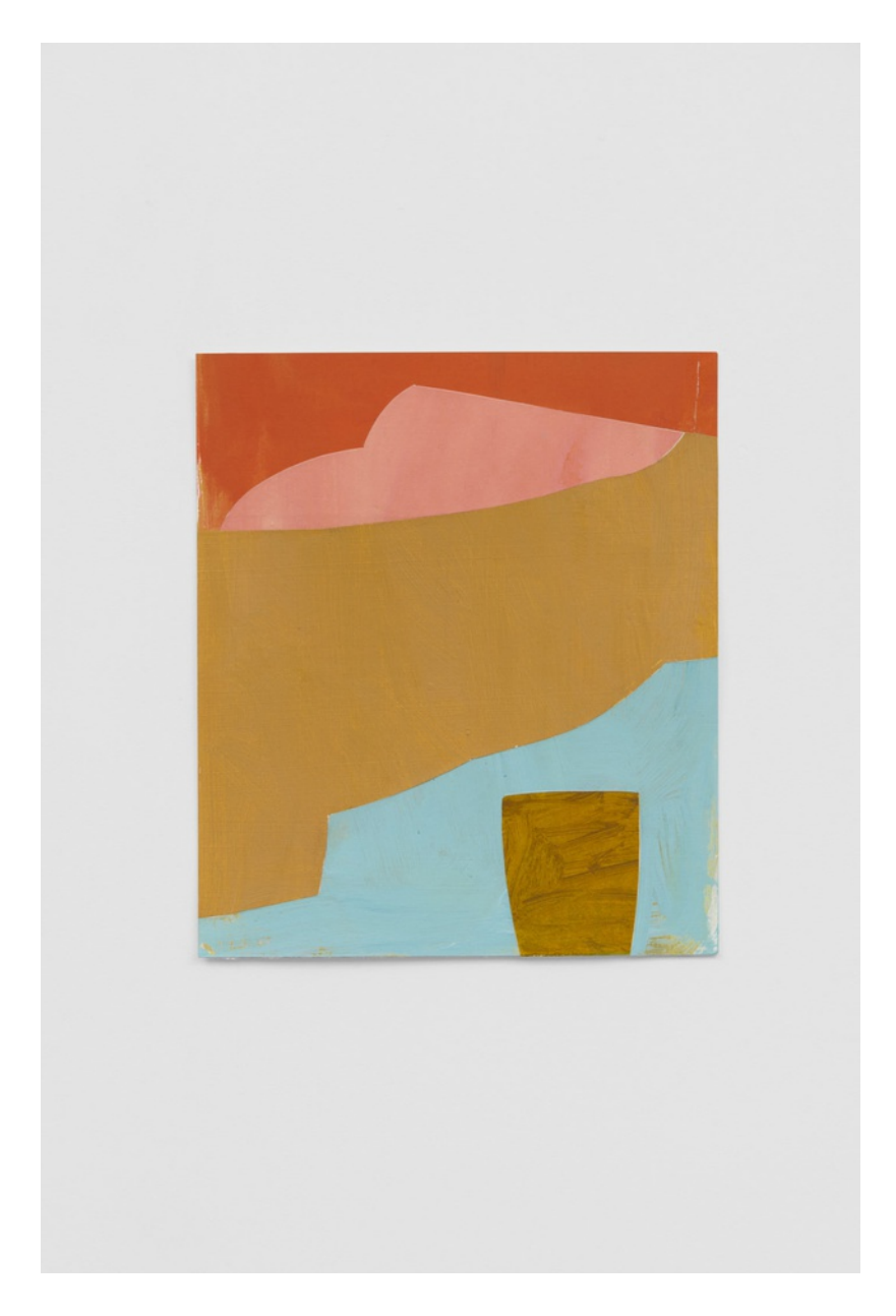
Woodcut, gouache and oil on collaged paper 36 \times 26 \text{ cm} (GOODY_96)