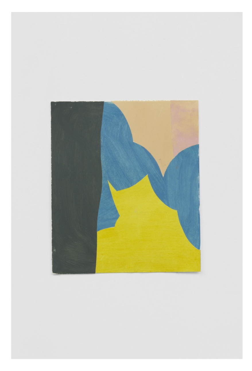
Woodcut, gouache and oil on collaged paper 36 \times 26 \text{ cm} (GOODY_95)