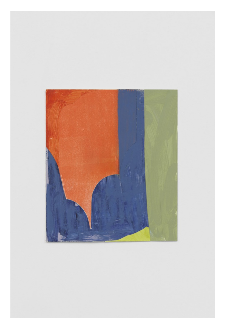
Woodcut, gouache and oil on collaged paper 36 \times 26 \text{ cm} (GOODY_85)