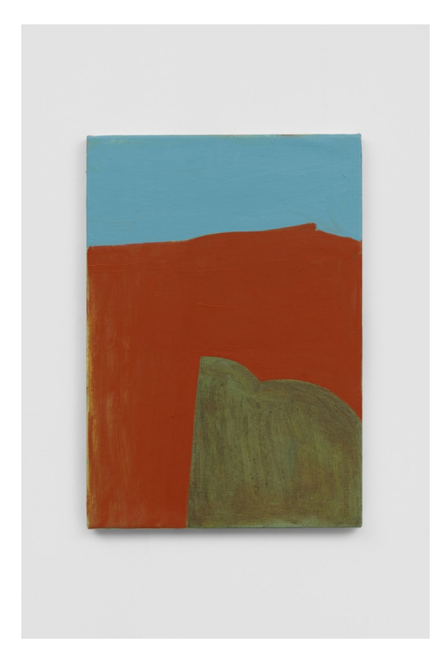
Oil on canvas 51 x 36 cm (GOODY_77)