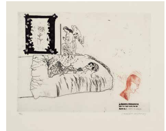
Collectors’ pieces: clockwise from left: Andy Warhol and his “Brillo Soap Pads” boxes; Edgar Degas’ “Mr and Mrs Manet”; Peter Blake’s “Portrait of David Hockney in a Hollywood Spanish Interior”; Hockney’s “Death in Harlem” from “A Rake’s Progress”