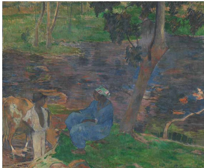
Seal of friendship: an 1887 “Sunflowers” painting by van Gogh, opposite, and Gauguin’s “On the Banks of the River at Martinique”, left